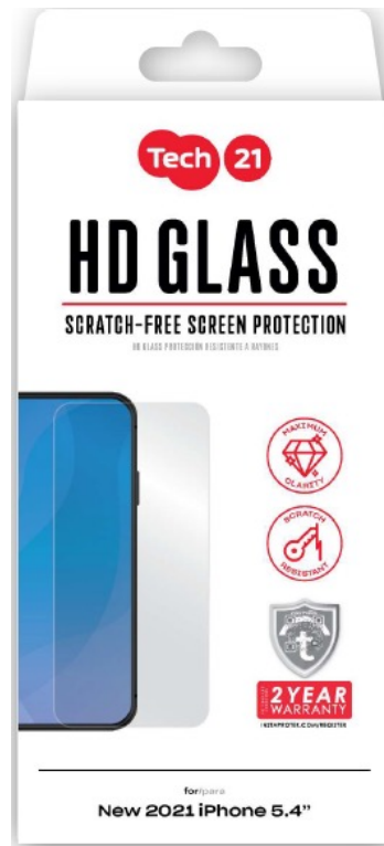
HD Glass with Installation Guide