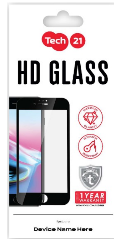
HD Glass Standard